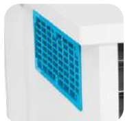
Well placed vents to the rear and base.