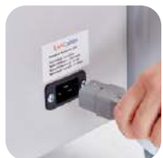
IEC power cable into the mains.