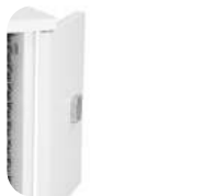
Front door opens 270 degrees.