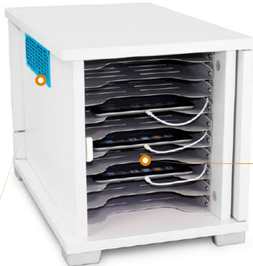
1.6mm grey steel fixed shelves with ventilations.