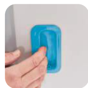
Inset door handles.