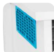
Well placed vents to the rear and base.