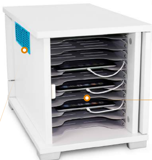
1.6mm grey steel fixed shelves with ventilations.