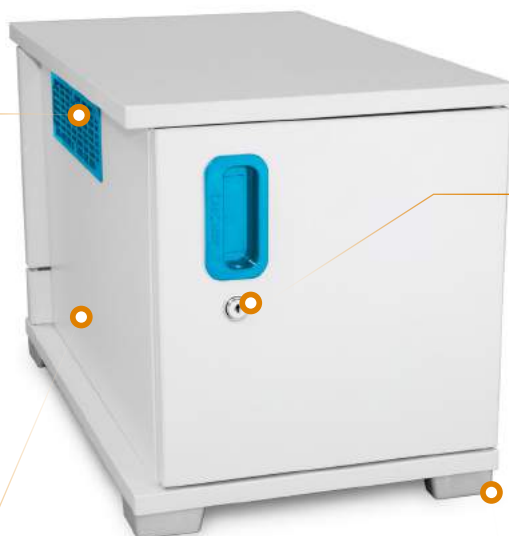
Lock supplied with 6 plate lever activation system.