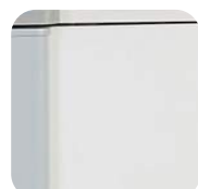
Strong MFC cladding.