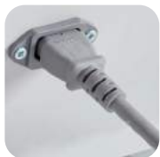
IEC power cable into the mains.