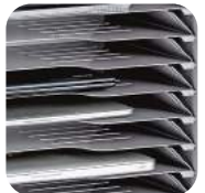
1.2mm grey steel fixed shelves with ventilations.