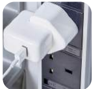
Device adapters plug into 2x8-way powerstrips.