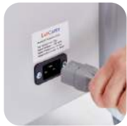
IEC power cable into the mains.