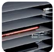
Individual steel storage compartment.