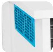
Well placed vents to the rear and base.