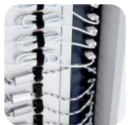
USB cables are connected in the side locked compartment