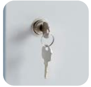
Lock supplied with 6 plate lever activation system.