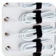
Individual velcro cable fasteners secure cables in place