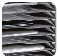
1.2mm grey steel fixed shelves with ventilations.