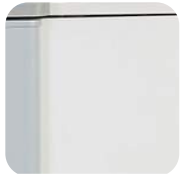
Strong MFC cladding.