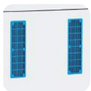
Well placed air vents to the rear and base.