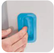
Inset door handles.