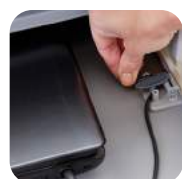
Twisting cable clips to keep devices in place and free from damage.