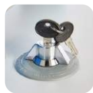
Dual point locking Key system.