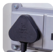
Device adapters plug into 2x8-way power strip.