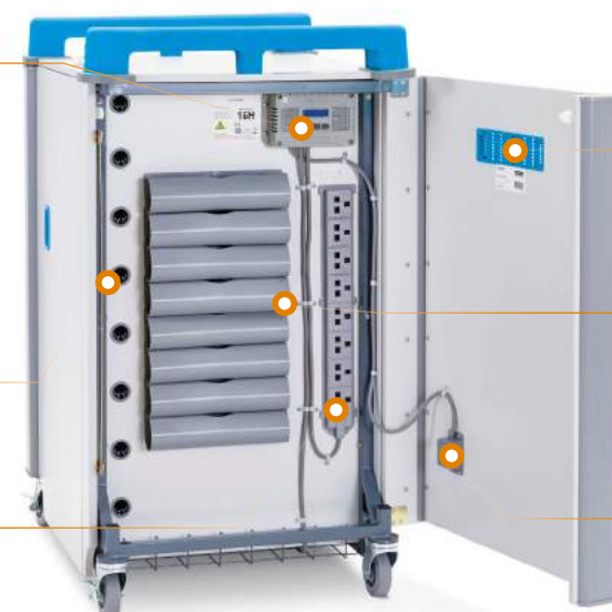
Well placed vents allow constant air circulation.