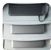
Individually sliding shelves for easy storage and protection.