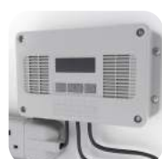
Power 7 Management System manages the power consumption.