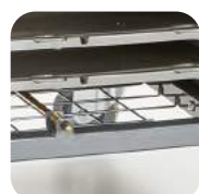
Fully welded steel frame with weldmesh base for constant air flow.