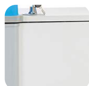
Strong MFC cladding.