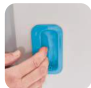
Inset door handles.