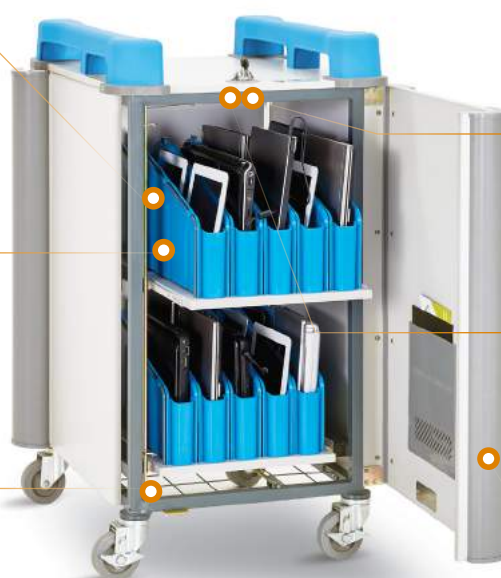
Built-in heat sensor will shut off power if a device overheats.