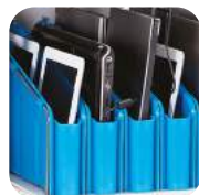
Devices stored vertically in protective storage on sliding shelves.