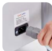
IEC socket with 1.8m designed to snap out if pulled away.