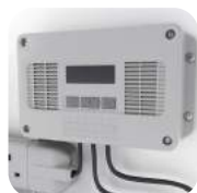
Power 7 Management System manages the power consumption.