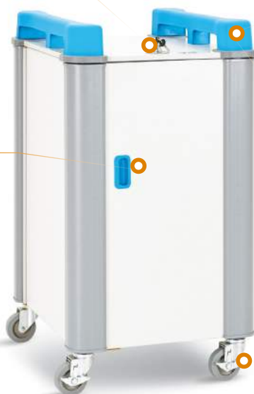
Ergonomic ABS handles.