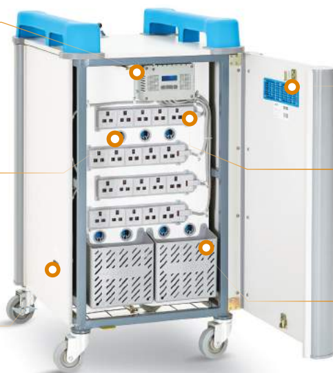
Well placed vents allow constant air circulation.