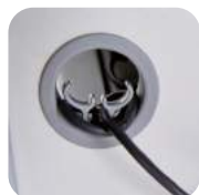
Cable clip portholes feed cables.