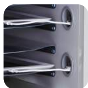
Cable clip portholes to gether excess cables.