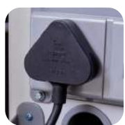
Device adaptors plug into 2x8-way power strips.