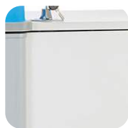
Strong MFC cladding.