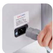
IEC socket with 1.8m designed to snap out if pulled away.