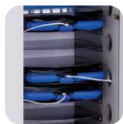
Individual fixed shelf compartments.