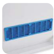
Well placed vents allow constant air circulation.