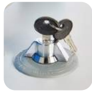
Dual point locking Key system.