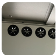
Rubber cable ports.