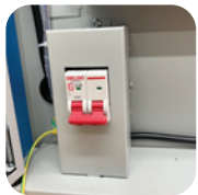
Power surge switch.