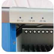
Charging indicator for each shelf.