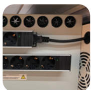
Power strips linked to the smart power charging system.