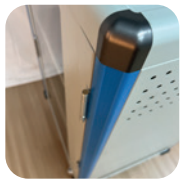
Robust corner extrusions.