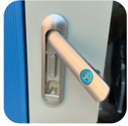
Secure Key lock with integral handle.